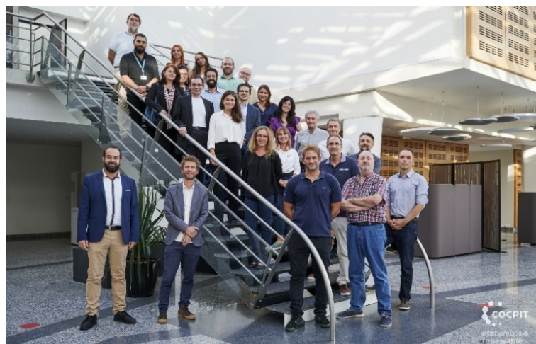
Figure 2: The COCPIT team at the kick-off-meeting at IMT Atlantique in Nantes, France, October 2023.

The COCPIT AI based decision tool will be fast and flexible, allowing the examination of several prospective scenarios, the comparison of established and novel technologies and the identification of the most sustainable conversion pathways. Moreover, COCPIT will work towards the centralisation of sustainable transport fuels innovations, delivering a comprehensive marketplace where the COCPIT decision tool and a range of technological solutions will be at investors' service, helping them to choose the best solution for their algal-based fuels project.